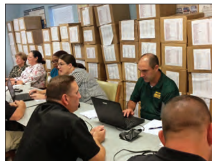
Wills for Heroes event in Amite, LA.