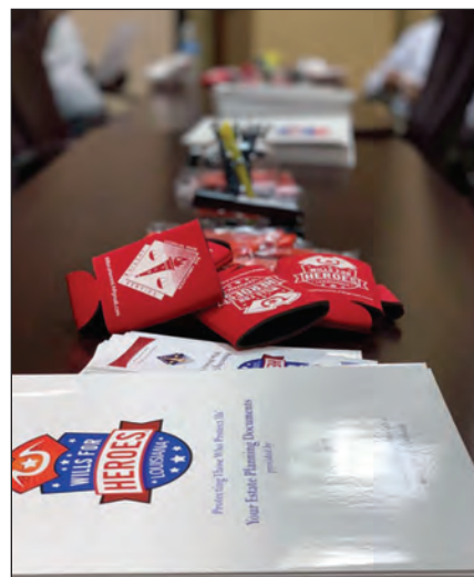
Wills for Heroes event in Lafayette, LA.