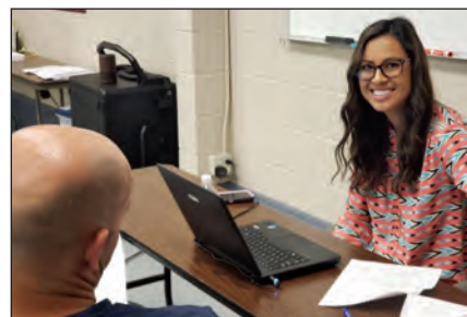
Wills for Heroes event in Baton Rouge, LA.