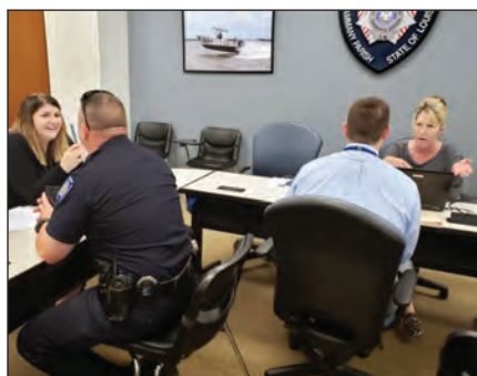
Wills for Heroes event in Covington, LA.