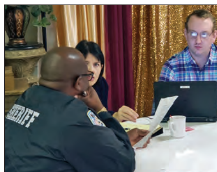
Wills for Heroes event in Terrytown, LA.