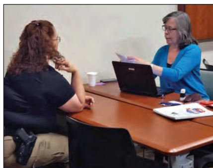
Wills for Heroes event in St. Tammany Parish.