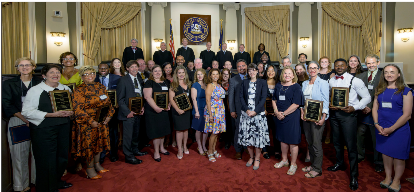
Louisiana Supreme Court Justices and award recipients.

For more information, visit www.lsba.org/atj .