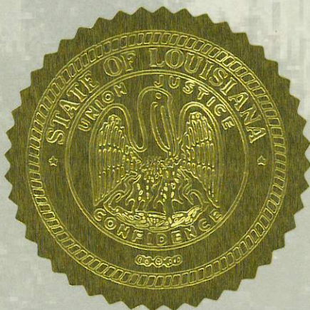
John Bel Edwards Governor

IN WITNESS WHEREOF, I have hereunto set my hand officially and caused to be affixed the Great Seal of the State of Louisiana, at the Capitol, in the City of Baton Rouge, on this 23rd day of October A. D., 2023.