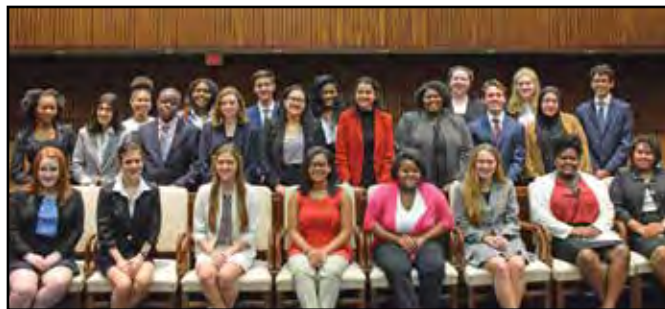
The 24 student interns participating in the 2018 Suit Up Program.