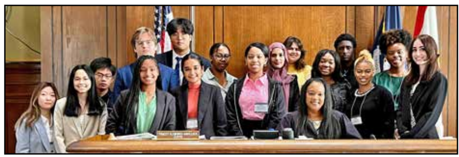
Suit Up students with Judge Tracey E. Flemings-Davillier, Section B, Orleans Parish Criminal District Court, seated.