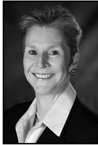
Hon. Suzan Ponder (Ret.)