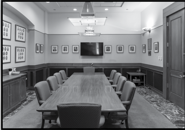
The Past President's Room Seating Capacity: 10