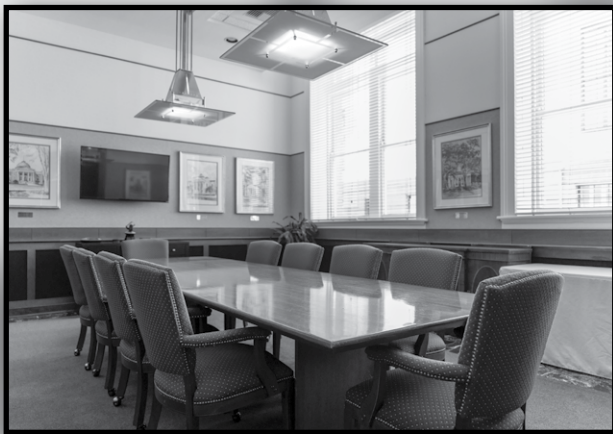
The Lafayette Room Seating Capacity: 10