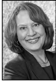
Hon. Charlotte A.L. Bushnell (Ret.)