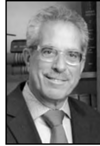
Hon. Franz L. Zibilich (Ret.)