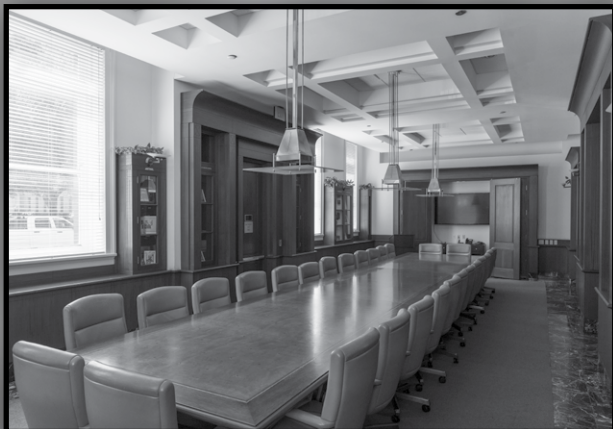
The Founder's Room Seating Capacity: 28

Do you need a conference room for a meeting or mediation?