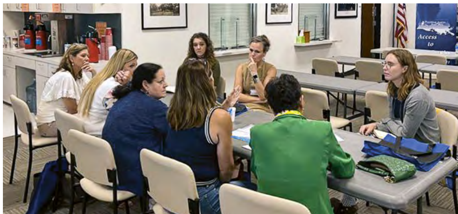
A lively breakout session during the SRL Summit where participants shared challenges, exchanged ideas, and explored practical solutions to improve outcomes for self-represented litigants.