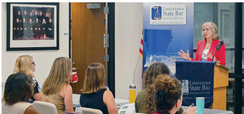
Hon. Patti Oppenheim of the 22nd Judicial District Court welcomes attendees to the SRL Summit and shares a judge's perspective.