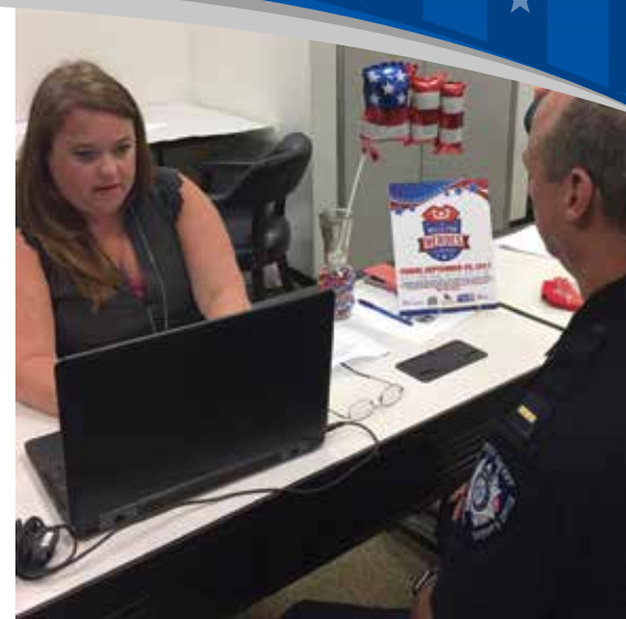
A 2017 Wills for Heroes event in 22nd JDC.