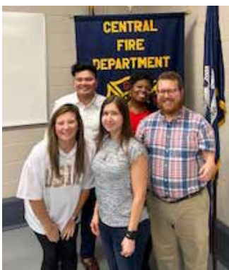
Wills for Heroes event at the Central Fire Department.

In October 2008, the Louisiana State Bar Association's Young Lawyers Division (YLD) hosted Louisiana's first Wills for Heroes event in Lake Charles for the Calcasieu Parish Fire Department. Since that time, the YLD has continued to host events for Louisiana's first responders, including firemen, police officers, sheriffs' deputies and state troopers. On Sept. 30, 2023, the YLD returned to Lake Charles for a Wills for Heroes event to celebrate 15 years of providing first responders and their spouses with attorney volunteers to assist in preparing wills and other estate planning documents at no charge.