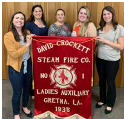
Wills for Heroes event at the David Crockett Steam Fire Co. in Gretna.

W ills for Heroes is a 501(c)(3) non-profit established in 2001. The Louisiana State Bar Association's Young Lawyers Division (LSBA YLD) first partnered with Wills for Heroes in 2008. As part of the program, members of the YLD visit Louisiana communities to provide estate documents to first responders and their spouses. This gives the first responders and their families the peace of mind knowing their affairs are in order should the unthinkable occur.