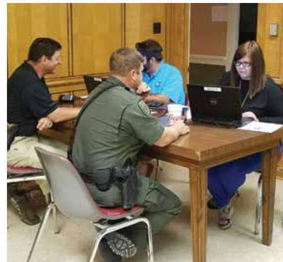
A 2017 Wills for Heroes event in Opelousas.